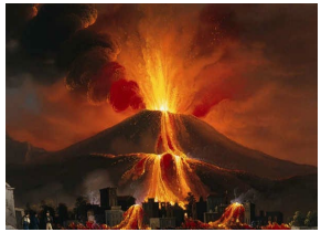
Mount Vesuvius in Pompeii