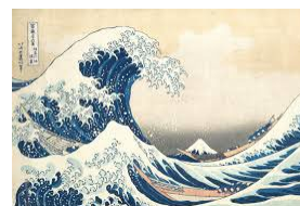
All about the picture

Art: Japanese Wave painting (colour, tone, texture & Shades) Artist: Katsushika Hokusai The Picture